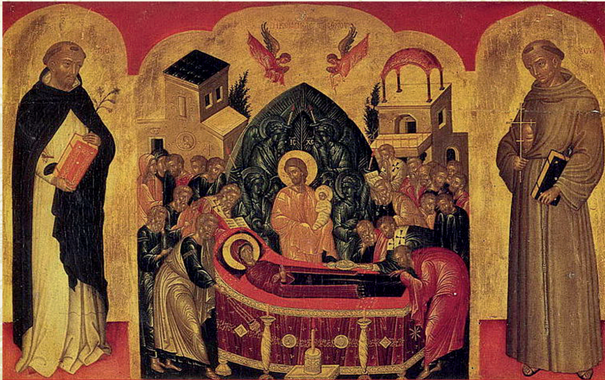
Icon of the Dormition of the Virgin with Saint Dominic and Saint Francis (end of 15 th c.), Moscow, Pushkin Museum

RESEARCH CENTRE FOR BYZANTINE AND POST-BYZANTINE ART